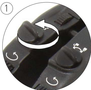
1 Locking Manual fixing without any tool.